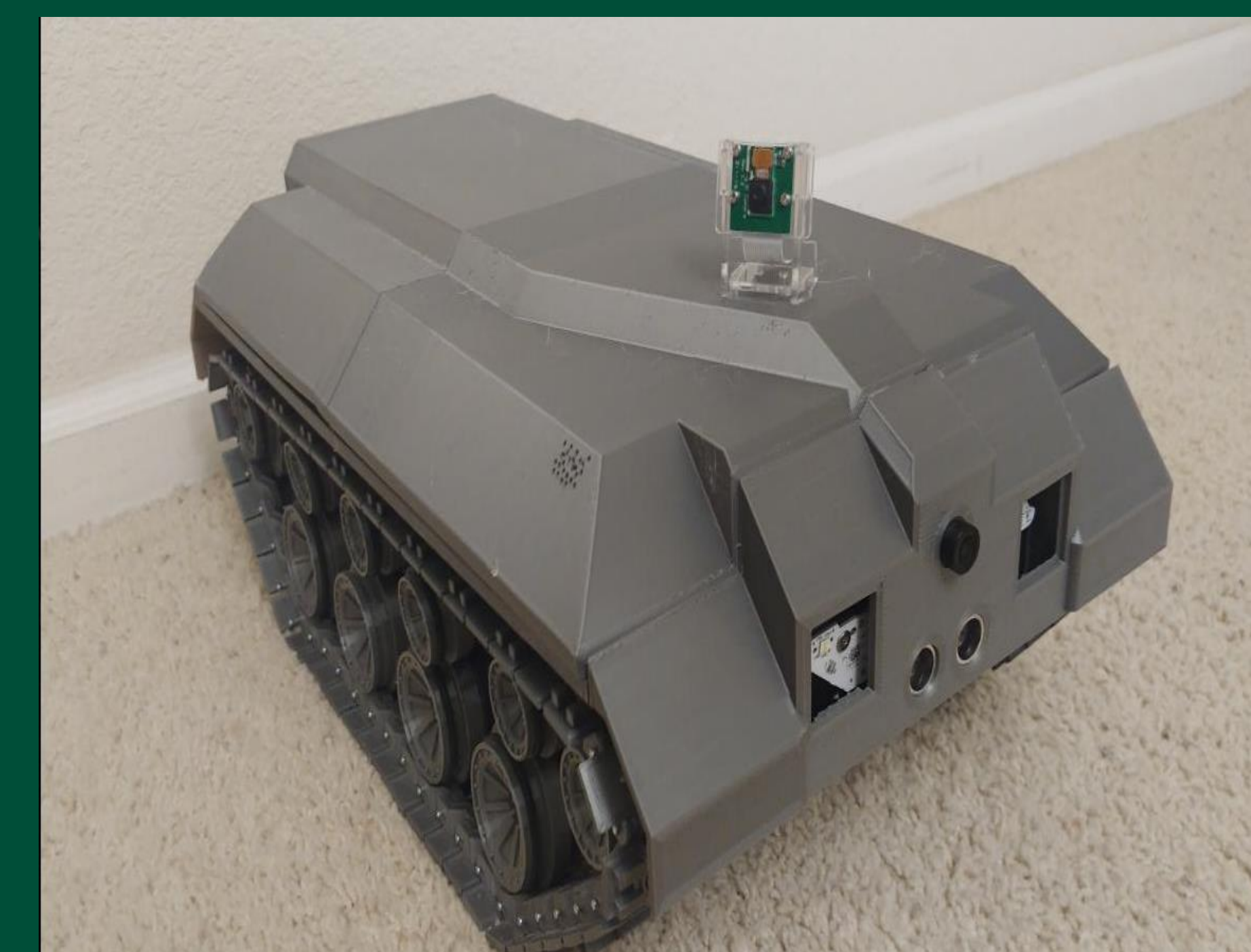
Figure 2: Robust tank body for movement in rugged terrain

Our team has designed an automated agricultural robot that reduces the task of farming/gardening to simply harvesting. It utilizes primarily open-source hardware and software to keep costs low. We have constructed a sturdy, tank-like body (see figure 2) on which will be a plow, a seed dispenser, (see figure 3) and a suite of sensors for collecting critical soil nutrients data and proper rover movement.